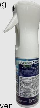
ITEM # ECAS5007 EnviroNizer™ Catholyte 185 ml Airless Pump Sprayer