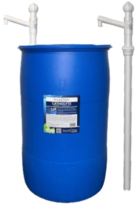
ITEM # ENV208pump Made to accommodate our 208L barrels