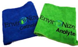
ITEM # ENVFT-A Anolyte ITEM # ENVFT-C Catholyte