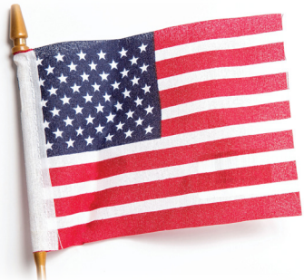
Flag for the United States of America

I pledge allegiance to the flag of the United States of America and to the Republic for which it stands, one Nation under God, indivisible, with liberty and justice for all.