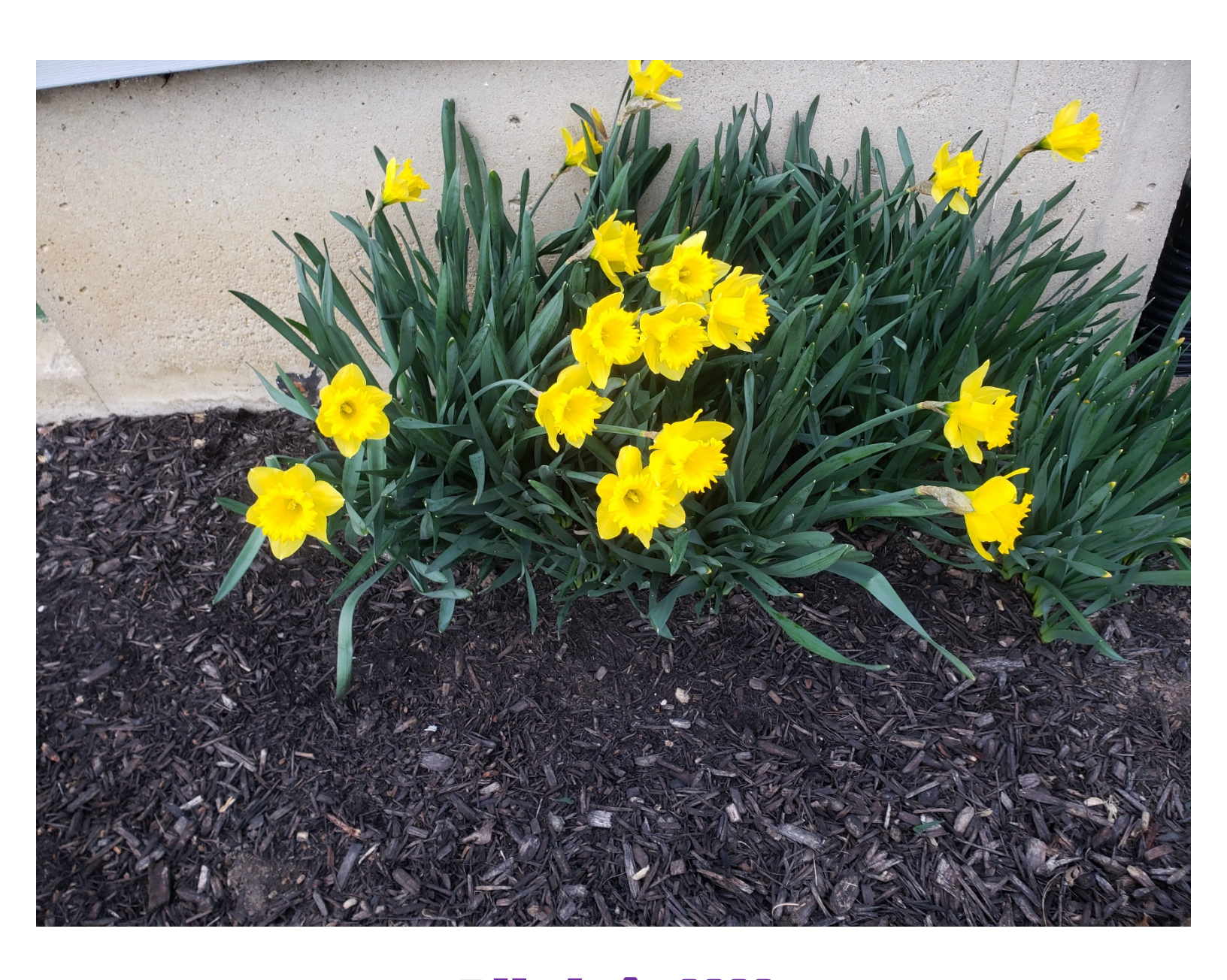
Alleluia!!!! Christ Is Risen!!!!