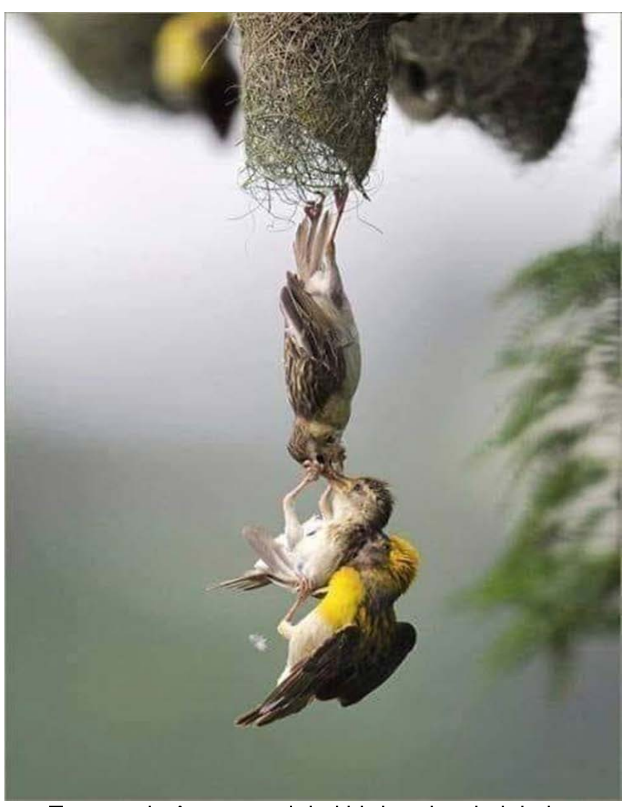
Teamwork: A mom and dad bird saving their baby.