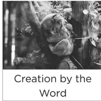
Creation by the Word