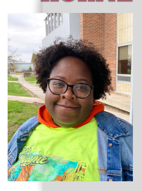
By: Ta Gay Htoo