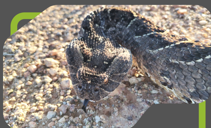
PUFF ADDER (BITIS ARIETANS)