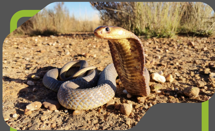
SNOUTED COBRA (NAJA ANNULIFERA)