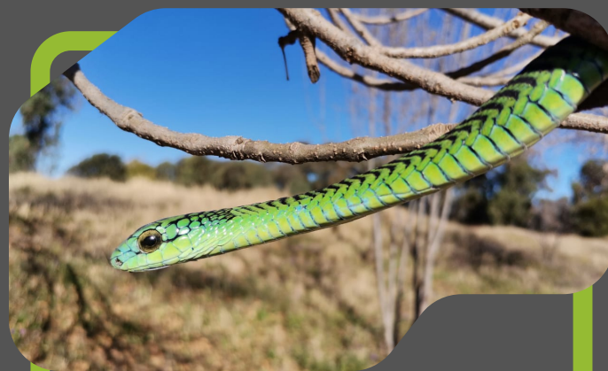
BOOMSLANG (DISPHOLIDUS TYPUS)