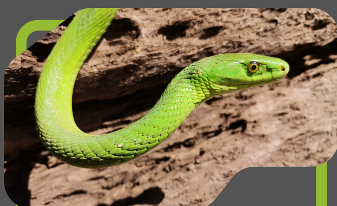
GREEN MAMBA (DENDROASPIS ANGUSTICEPS)