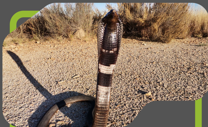
RINKHALS (HEMACHATUS HAEMACHATUS)