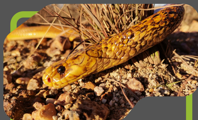
CAPE COBRA (NAJA NIVEA)