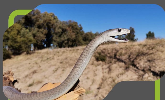
BLACK MAMBA (DEONDROASPIS POLYLEPIS)