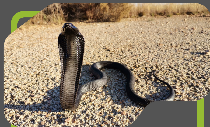
BLACK SPITTING COBRA (NAJA NIGRICINCTA WOODI)