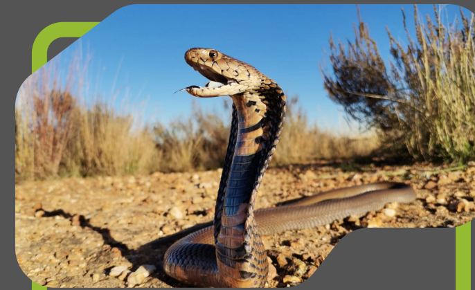
MOZAMBIQUE SPITTING COBRA (NAJA MOSSAMBICA)