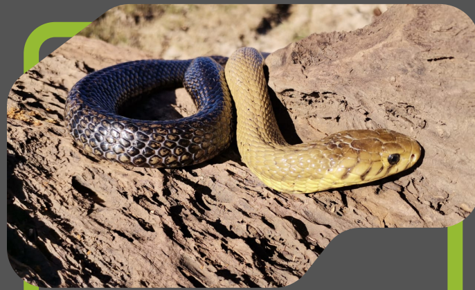
FOREST COBRA (NAJA SUBFULVA)