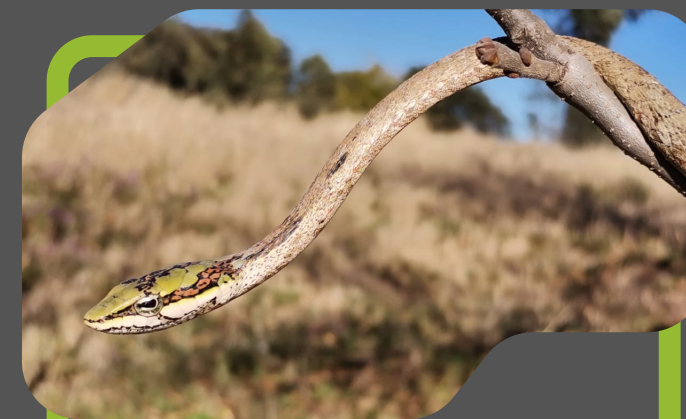
VINE SNAKE (THELOTORNIS CAPENSIS)