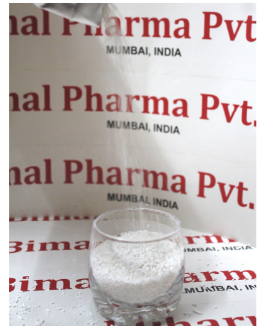
POTASSIUM SORBATE, E – 202 GOOD FLOW ABILITY