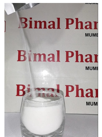
SORBIC ACID, E – 200 GOOD FLOW ABILITY