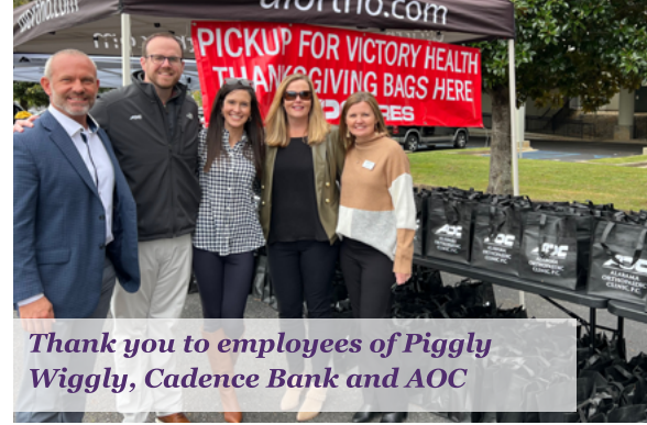
Thank you to employees of Piggly Wiggly, Cadence Bank and AOC