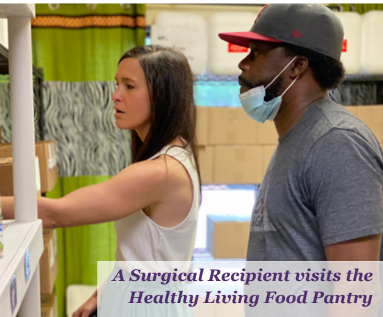
A Surgical Recipient visits the Healthy Living Food Pantry