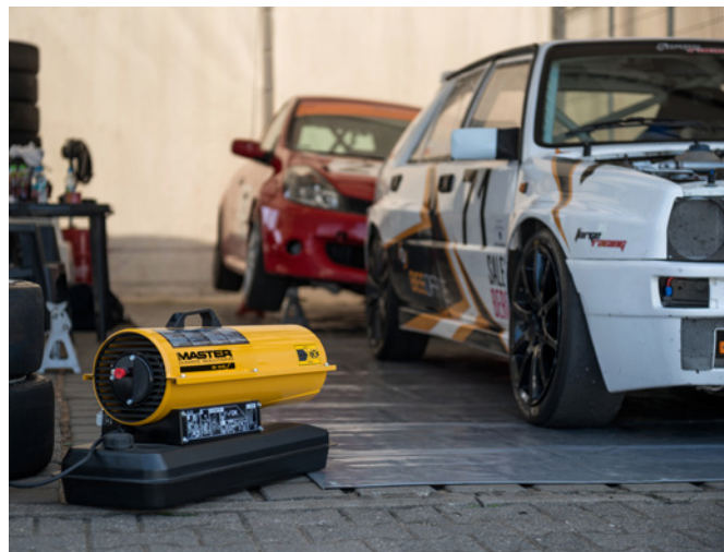
Master B 35 heating a garage

Ventilation of the room is necessary to prevent a deficiency of oxygen. Master direct heaters are known for their efficiency, robustness, ease of use and operational safety.