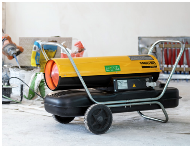
Master B 150 on a construction site