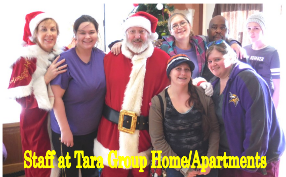
Staff at Tara Group Home/Apartments