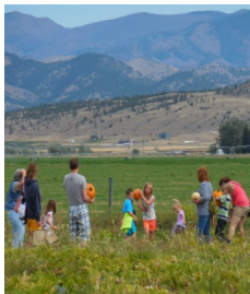
Searching for the perfect pumpkin

Mont Farm & Gardens Saturday, September 9, 2017, 10:30 AM - 3:00 PM. Admission is $5 per person or $30 for a carload of six or more, pay at the Farm gate. Admission includes lunch available from 11:00 AM till 2:00 PM.