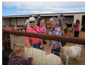
Visiting the petting zoo

the patch, enjoy entertainment, visit the petting zoo, and much more! West Mont Farm & Gardens is located at 3240 York Rd.