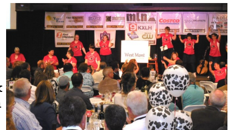
Cheer Squad performing in 2016.

In an effort to cut costs and make our event more mission-focused, this luncheon is being held instead of the Black Tie Blue Jean Benefit Dinner. There will be no auctions or raffles. Our famous Cheer Squad will be on hand to perform and we look forward to sharing with you the wonderful things that are happening at West Mont.