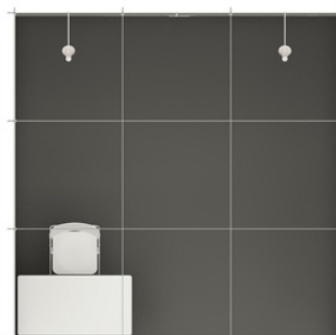
PLAN 3.00M x 3.00M