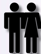
Men &amp; women