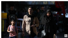
In den vergangenen Monaten hat man in Teheran, wie hier in Teheran, häufig Proteste ohne Kapital gesehen. Das können Sie sehen auch in der Foto-Galerie oben.