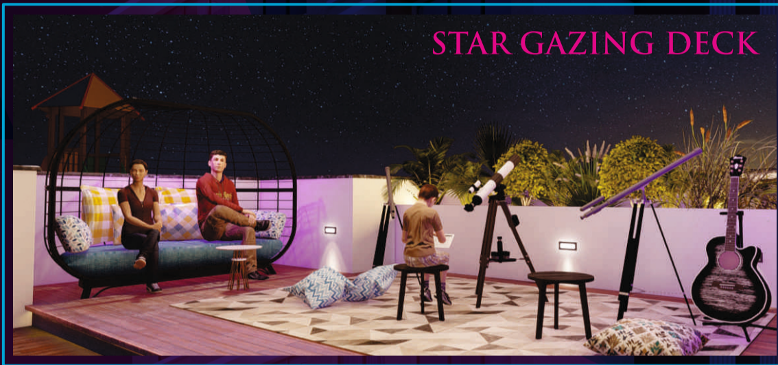
STAR GAZING DECK

Living, Dining, Foyer, Passage: Vitrified tiles 24" x 24" with skirting of 4" Bedrooms / Kitchen: Vitrified tiles 24" x 24" with skirting of 4" Toilets: Designer ceramic tiles Balconies / Utility: Matt finish Vitrified tiles Entrance Lobbies at Ground floor: Granite flooring Staircase: Granite - Ground to first floor, other floors - cement tiles Dadoing : Toilets: Designer ceramic tiles up to 7' height Kitchen & Utility: Imported Designer tiles for 2' above counter