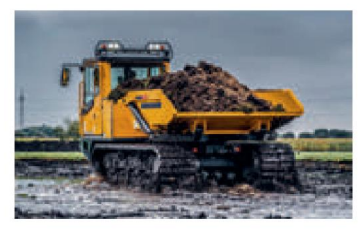
The C912s is safe, quick and gentle on the ground, even on difficult ground.