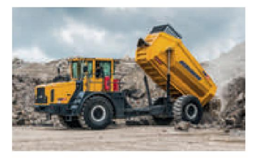
The vehicle's low center of gravity ensures a particularly high level of stability.