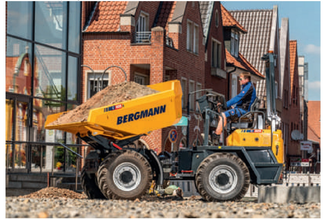
Machine Translated by Google