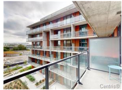
Midtown, 200 Marcel-Laurin, Saint-Laurent, Quebec, Canada