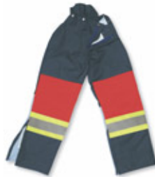
BK90736 (Shown Left)

Made of 600 Denier in the front with polyester back, these 3600-Threshold Faller Pants also come in 4100-Threshold, 90741.