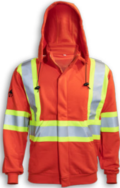
BK3556FRC-BLK • Sizes S-5XL