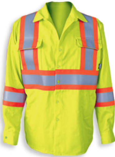
BK555FRI-4-LM • Sizes S-5XL