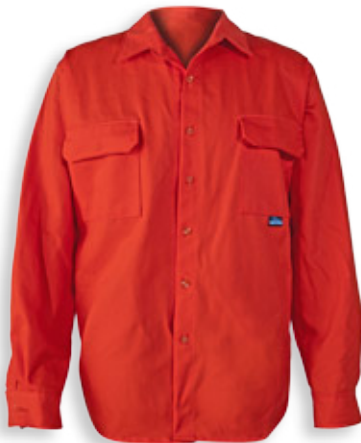
BK555FRI-NT-ORG • Sizes S-5XL

Big K's FR 7oz Indura Ultrasoft button down collar work shirt, comes with 2 chest pockets and 2" segmented reflective tape. Meets CAN/CGSB 155-20 (ASTM F1516) Arc Rating.