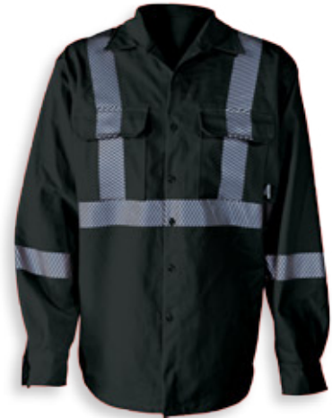
BK555FRI-2-BLK • Sizes S-5XL

Big K's FR 7oz Indura Ultrasoft button down collar work shirt, comes with 2 chest pockets and 2" segmented reflective tape. Meets CAN/CGSB 155-20 (ASTM F1516) Arc Rating.