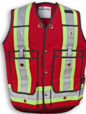
BK305-RED • Size S-5XL (Pictured Left)