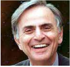
Carl Sagan was an astronomer and science communicator.

The Earth is a very small stage in a vast cosmic arena. Think of the endless cruelties visited by the inhabitants of one corner of this pixel on the scarcely distinguishable inhabitants of some other corner, how frequent their misunderstandings, how eager they are to kill one another, how fervent their hatreds. Think of the rivers of blood spilled by all those generals and emperors so that, in glory and triumph, they could become the momentary masters of a fraction of a dot.