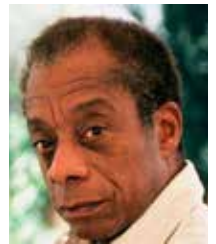
James Baldwin was an American writer of essays, novels, plays and poems.

“What is it you want me to reconcile myself to? I was born here almost 60 years ago. I’m not going to live another 60 years. You always told me it takes time. It’s taken my father’s time, my mother’s time, my uncle’s time, my brothers’ and my sisters’ time, my nieces’ and nephews’ time. How much time do you want for your progress?”