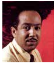
Langston Hughes was an American poet, social activist, novelist, playwright and columnist.

One: I dream a world where one No other one will scorn, Many: Where love will bless the earth And peace its paths adorn One: I dream a world where all Will know sweet freedom's way, Many: Where greed no longer saps the soul Nor avarice blights our day. One: A world I dream where Black or white, Whatever race you be, Many: Will share the bounties of the earth And every one is free, One: Where wretchedness will hang its head And joy, like a pearl, Many: Attends the needs of all humankind- Of such I dream, my world!