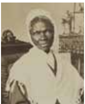
Sojourner Truth was an American abolitionist and women's rights activist.

One: O, God, you know I have no money, but you can make the people do for me, and you must make the people do for me. I will never give you peace till you do, God. Many: O, God, you know I have no —, but you can make the people do for me, and you must make the people do for me. I will never give you peace till you do, God Amen