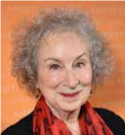
Margaret Atwood is a Canadian novelist, poet, literary critic, and essayist.

The moment when, after many years of hard work and a long voyage you stand in the centre of your room, house, half-acre, square mile, island, country, knowing at last how you got there, and say, I own this,