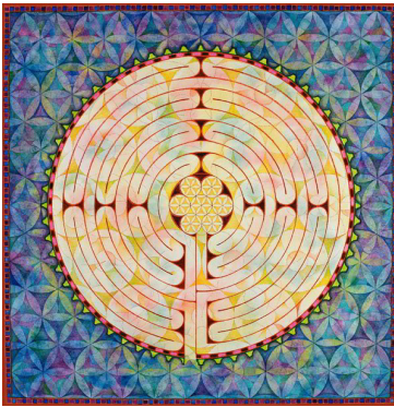
Come, take the journey, April 6 & 7.