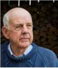
Wendell Berry is an American novelist, poet, essayist, environmental activist, cultural critic, and farmer.

The concept of health is rooted in the concept of wholeness. To be healthy is to be whole. The word health belongs to a family of words, a listing of which will suggest how far the consideration of health must carry us: heal, whole, wholesome, hale, hallow, holy. And so it is possible to give a definition to health that is positive and far more elaborate than that given to it by most medical doctors and the officers of public health. . . .