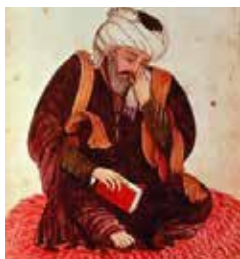
Hafiz was a 14th century Persian poet who lauded the joys of love and wine and targeted hypocrisy.

You are the sun in drag. You are God hiding from yourself. Remove all the “mine”—that is the veil. Why ever worry about Anything? Listen to what your friend Hafiz Knows for certain: The appearance of this world Is a Magi’s brilliant trick, though its affairs are Nothing into nothing. You are a divine elephant with amnesia Trying to live in an ant Hole. Sweetheart, O sweetheart You are God in Drag!