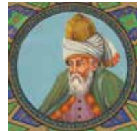
Rumi was a 13th-century Persian poet, Islamic scholar, Maturidi theologian, and Sufi mystic