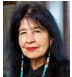
Joy Harjo is an American poet, musician, playwright, and author. She served as the 23rd United States Poet Laureate, the first Native American to hold that honor.

You must clean yourself with cedar, sage, or other healing plant.