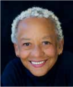
Nikki Giovanni is an American poet, writer, commentator, activist, and educator.

It's not a hug Nor mistletoe at Christmas It's not a colored egg At Easter Nor a bunny hopping Across the meadow It's a vote Saying you are A citizen Though it sometimes Is chocolate Or sometimes vanilla It can be female Or male It is right Or left I can agree Or disagree but And this is an important but I am a citizen I should be able To vote from prison I should be able To vote from the battlefield I should be able To vote when I get a driver's license I should be able To vote when I can purchase a gun I must be able To vote If I'm in the hospital If I'm in the old folks' home If I'm needing a ride To the Polling Place I am a citizen