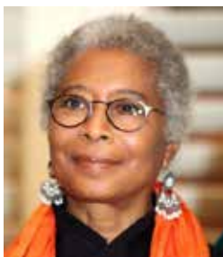
Alice Walker is an American novelist, short story writer, poet, and social activist. She became the first African-American woman to win the Pulitzer Prize for Fiction, for her novel The Color Purple .

“Some periods of our growth are so confusing that we don’t even recognize that growth is what is happening. We may feel hostile or angry or weepy and hysterical, or we may feel depressed. It would never occur to us, unless we stumbled on a book or person who explained it to us, that we were in fact in the process of change, of actually becoming larger, spiritually, than we were before. Whenever we grow, we tend to feel it, as a young seed must feel the weight and inertia of the earth as it seeks to break out of its shell on its way to becoming a plant. Often the feeling is anything but pleasant. But what is most unpleasant is the not knowing what is happening . . . Those long periods when something inside ourselves seems to be waiting, holding its breath, unsure about what the next step should be, eventually become the periods we wait for, for it is in those periods that we realize that we are being prepared for the next phase of our life and that, in all probability, a new level of the personality is about to be revealed.” — Alice Walker, Living by the Word: Essays