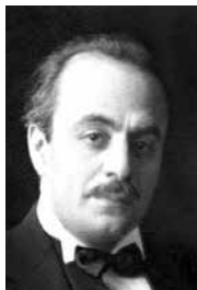
Kahlil Gibran was a Lebanese- American writer, poet and visual artist.

Once there ruled in the distant city of Wirani a king who was both mighty and wise. And he was feared for his might and loved for his wisdom.