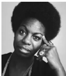
Nina Simone was an American singer, songwriter, pianist, composer, arranger, and civil rights activist.