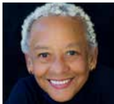
Nikki Giovanni was an American poet, writer, commentator, activist and educator.

I was born in the congo I walked to the fertile crescent and built the sphinx I designed a pyramid so tough that a star that only glows every one hundred years falls into the center giving divine perfect light I am bad I sat on the throne drinking nectar with allah I got hot and sent an ice age to europe to cool my thirst My oldest daughter is nefertiti the tears from my birth pains created the nile I am a beautiful woman I gazed on the forest and burned out the sahara desert with a packet of goat's meat and a change of clothes I crossed it in two hours I am a gazelle so swift so swift you can't catch me For a birthday present when he was three I gave my son hannibal an elephant He gave me rome for mother's day My strength flows ever on My son noah built new/ark and I stood proudly at the helm as we sailed on a soft summer day I turned myself into myself and was jesus men intone my loving name All praises All praises I am the one who would save