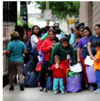
Learn how you can help migrant siblings.

Buses of migrants from the U.S. border may be coming to our city, and the new arrivals will need help from local churches. The busing started last spring as a political statement by some state governors to show their displeasure with U.S. border policy by relocating migrants to "sanctuary cities."