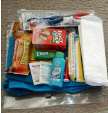
Bring your contributions on Sundays.

The Community and Care Board requests your help to provide items for comfort bags to be distributed to visitors in need. Please bring gloves, socks, tissues, hand sanitizer, hand warmers, granola bars and other shelf-stable foods that don’t require a can opener. Items can be left in the bin by the Welcome Table in the Lounge on Sundays. Thank you for helping us reach out in care and compassion to the most vulnerable in our community. 🌐