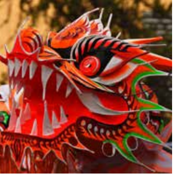
Join the festivities February 22.

Seattle’s Lunar New Year celebration in the historic Chinatown/International District marks the Year of the Snake, and will be publicly celebrated from 11 am–4 pm Saturday, February 22. Vendor booths will line up along South King St., dance performances and music will take place throughout the day. With a variety of food options, family-friendly activities and cultural exhibits, there’s something for everyone. Visit SeattleChinatownID.com to learn more. 🌐