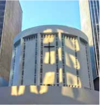
155th Annual Meeting Sunday, February 16.

Plan to attend Plymouth’s 155th Annual Meeting Sunday, February 16, after worship in Hildebrand Hall and live online (the link to join online via Zoom will be shared closer to the meeting date.). Light lunch provided. The Annual Report will be reviewed, and your vote is needed to install new lay leadership and approve the 2025 budget for our church family. Celebrate 2024 and look ahead to 2025. Please join us for this important time to gather with our beloved community. 🌐