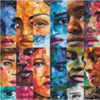
After worship every Sunday through Feb. 2.