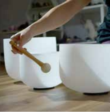
Next session is Sunday, February 9.