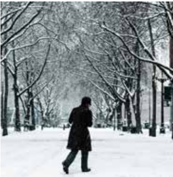
Access resources to stay warm at Kcrha.org .

King County is expecting freezing temperatures. If you or someone you know is in need of a place to get and stay warm, overnight and daytime shelters are open around the county. Visit Kcrha.org for a list and links to resources and information about work being done to help end homelessness. 🌐