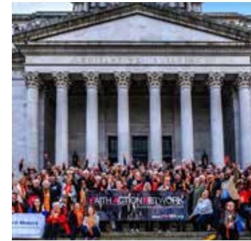
Join Interfaith Advocacy Day February 20

Gather in Olympia and Online for Faith Action Network's Annual Interfaith Advocacy Day to promote FAN's legislative agenda with state legislators, 9 am-3 pm Thursday, February 20. Interfaith Advocacy Day brings the voices of compassion and justice to our elected leaders.