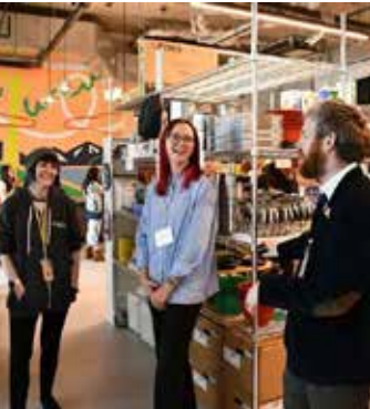
Help by providing goods or your time.

Occupying the street-level commercial space of Sylvia Odom’s Place—one of Plymouth’s 17 permanent supportive housing buildings across the region—the PSC provides a critical service. Learn about donating new and used items or volunteering at PlymouthHousing.org . 🌐