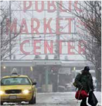
Access resources to stay warm at Kcrha.org .

King County is expecting freezing temperatures. If you or someone you know is in need of a place to get and stay warm, overnight and daytime shelters are open around the county. Visit Kcrha.org for a list and links to resources and information about work being done to help end homelessness. 🌍