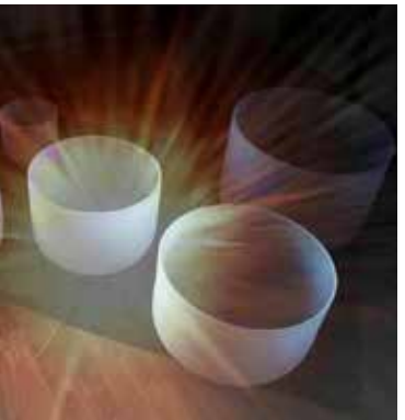
Next session is Sunday, February 9