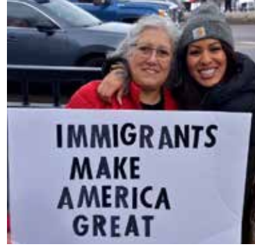
Stand up and speak out against injustice.

The United Church of Christ Office of Public Policy and Advocacy urges people of faith to say NO to xenophobic immigration policies. President Trump has signed or is poised to sign multiple executive orders mentioned in his Inaugural Address that punish immigrants all while wasting government resources. This includes: