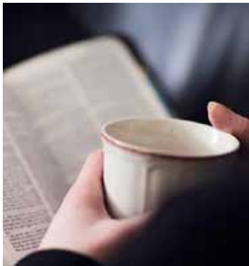
9 am Wednesdays and 7 pm Thursdays.