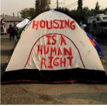
Help get out the vote for February 11 election!

In the February 11 special election, Seattleites will be voting on an initiative with huge implications for funding a new housing tool in Seattle — social housing. If it passes, Prop 1A would generate an estimated $50 million for social housing through a progressive revenue tax on the wealthiest businesses.