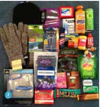
Bring your contributions on Sundays.

The Community and Care Board requests your help to provide items for comfort bags to be distributed to visitors in need. Please bring gloves, socks, tissues, hand sanitizer, hand warmers, granola bars and other shelf-stable foods that don’t require a can opener. Leave donations in the bin by the Welcome Table in the Lounge. Thank you for your care and compassion to the most vulnerable in our community. 🌍