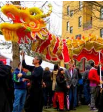
Join the festivities February 22.

Enjoy Seattle’s Lunar New Year celebration in the historic Chinatown/International District 11 am–4 pm Saturday, February 22. Vendor booths will line South King St. With dance and music, a variety of food options, family-friendly activities and cultural exhibits, there’s something for everyone. Visit SeattleChinatownID.com to learn more. 🌍