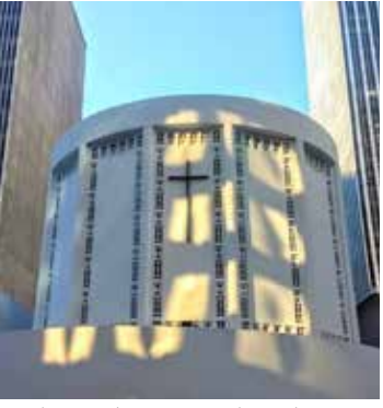
155th Annual Meeting Sunday, February 16.

Celebrate 2024 and look ahead to 2025. Please join us for this important time to gather with our beloved community. 🌍