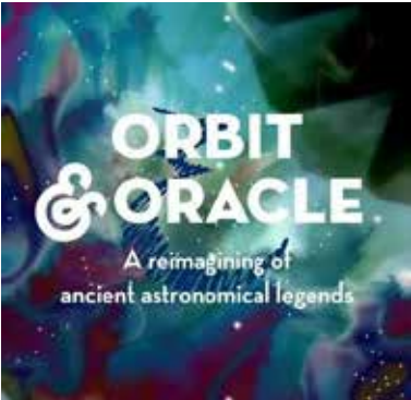
8 pm Saturday, March 8, at Plymouth.

More information and tickets at TheEsoterics.org .