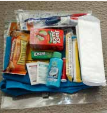
Bring your contributions on Sundays.

The Community and Care Board requests your help to provide items for comfort bags to be distributed to visitors in need. Please bring gloves, socks, tissues, hand sanitizer, hand warmers, granola bars and other shelf-stable foods that don’t require a can opener. Leave donations in the bin by the Welcome Table in the Lounge. Thank you for your compassionate care.