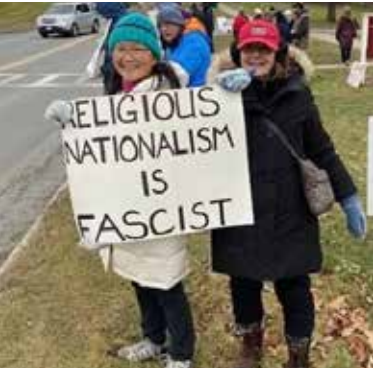
Visit ThisIsChristianity.org .

Not only is Christian Nationalism un-Christian –it’s un-American. Defying the separation of church and state by claiming our country a Christian nation, Christian Nationalism, with its focus on power and control, stands in stark contrast to the teachings of Jesus, which center on love of God and neighbor.