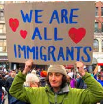
Stand up and speak out against injustice.

President Trump has signed or is poised to sign multiple executive orders mentioned in his Inaugural Address that punish immigrants all while wasting government resources.