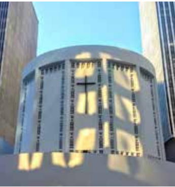
155th Annual Meeting Sunday, February 16.

Plan to attend Plymouth’s 155th Annual Meeting Sunday, February 16, after worship in Hildebrand Hall and live online (the link to join online via Zoom will be shared closer to the meeting date). Light lunch provided.