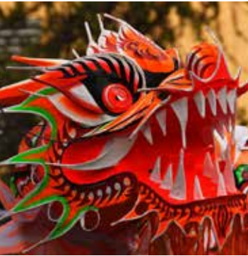
Join the festivities February 22.

The Lunar New Year Celebration highlights each zodiac animal and celebrates the year’s symbolism in the historic Chinatown/ International District. The festivities feature traditional dragon and lion dances, martial arts demonstrations, Japanese Taiko drumming, and other cultural performances.