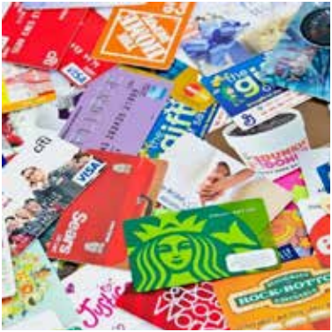
Bring unused gift cards for migrant siblings.

During the coming weeks of Lent, the Immigration Ministry Team is conducting our first ever Gift Card Transformation Campaign. It is a great time to go on a search for unused gift cards in your junk drawer or on your desk somewhere. Unspent cards collected will be distributed to families in the immigration process that we are already helping. All cards will be accepted and we will find clever ways to use them.