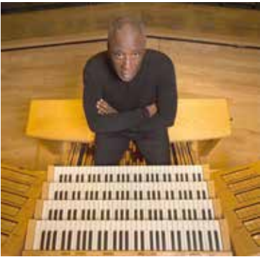
Wayne Marshall performs March 2.

Come to Plymouth 8 pm Saturday, March 2, for a solo concert by virtuoso organist Wayne Marshall presenting the great Passion Symphony by French organist and composer Marcel Dupré. Pre-concert talk at 7:15 pm. Admission includes talk, performance, wine and appetizers.