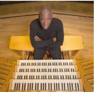
Wayne Marshall performs March 2.

Come to Plymouth 8 pm Saturday, March 2, for a solo concert by virtuoso organist Wayne Marshall presenting the great Passion Symphony by French organist and composer Marcel Dupré. Pre-concert talk at 7:15 pm. Admission includes talk, performance, wine and appetizers. British conductor, organist and pianist Wayne Marshall is world-renowned for his musicianship and versatility on the podium and at the keyboard. Please join us for an evening of unforgettable music. Tickets at SeattleChamberOrchestra.org .