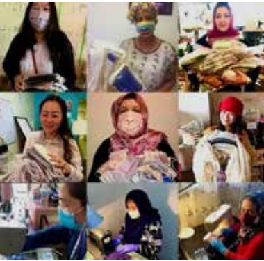
Join the Gala 6 pm Friday, March 22

Join Plymouth’s Sponsor Circle at Refugee Artisan Initiative’s Inaugural Gala, featuring a global meal, beverages, live auction, and dessert. During this multi-cultural celebration, you’ll have the opportunity to learn more about RAI’s work, meet the artisans, and support the mission.