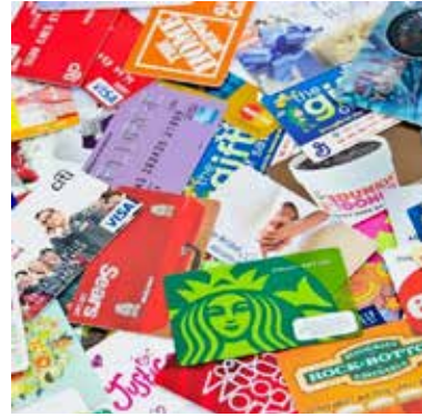
Bring unused gift cards for migrant siblings.

You probably don't know that 47% of US adults have at least one unspent gift card, averaging $187, totalling as much as $23 Million each year laying somewhere around their house. Indeed, Starbucks actually tallies these unspent cards into their income (called 'breakage'), and in 2022 alone, they reported $212 million in 'revenue' from these unused cards.