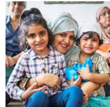
Join the discussion February 25.