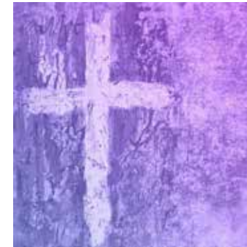
Ash Wednesday service at noon March 5

The traditions of Lent are derived from the season's origin as a time when the church prepared candidates, or "catechumens," for their baptism into the Body of Christ. Self-examination, study, fasting, prayer and works of love are disciplines historically associated with