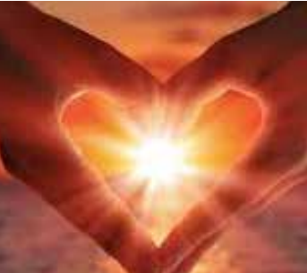
Let us know what we can do for you.

Your Plymouth Care Team is committed to responding to all care concerns that come our way. Please use the Plymouth Care Line phone number to get in touch: 206-639-7739 . Messages checked daily. The Care Line is for non-emergency issues. For acute crises, call 988. Members of the Care Team are: