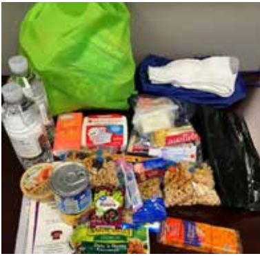
Pack bags during worship each Sunday in March.

Thank you for helping us reach out in care and compassion to the most vulnerable in our community. 🌍