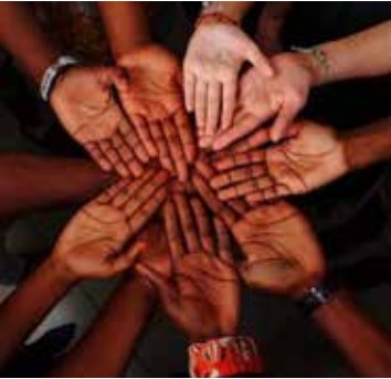
Your support brings help and hope.

The urgency of this work is all around us. Harmful policies, systemic inequities, detentions, deportations, and everyday injustices impact individuals, families, and entire communities. Every gift you contribute fuels this fight for justice. Thank you for showing up for immigrants in this critical moment. Visit Waisn.org to learn more and make a donation. 🌍