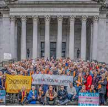
Get involved at Fanwa.org .

Read more and get involved at Fanwa.org . 🌍