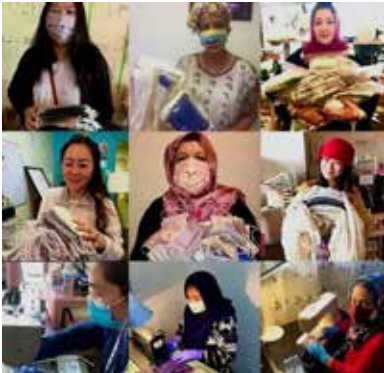
Join the Gala 6 pm Friday, March 22

Refugee Artisan Initiative partners with refugee and immigrant women to foster an inclusive, prosperous transition to the US through artisan skills training and micro business development. Join Plymouth’s Sponsor Circle at their Inaugural Gala, featuring a global meal, live auction, and dessert. Meet the artisans, and support the mission.