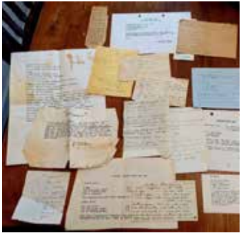
Let us know what’s cooking!