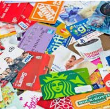
Bring unused gift cards for migrant siblings.