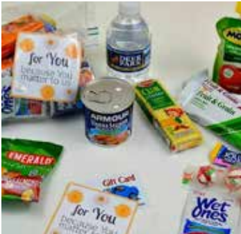
Your kindness makes a world of difference.