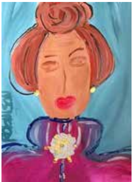
“Elizabeth Keckley,” from the Black Maids Tribute (courtesy of the artist)