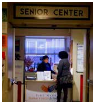
Share your passion and skills.

Pike Market Senior Center, located in the heart of Pike Place Market, is looking for willing folks to share their passions through facilitating workshops, lectures and skill sharing. We are developing opportunities to expand the minds, and increase socialization opportunities, of our members and need your help. All of our programming