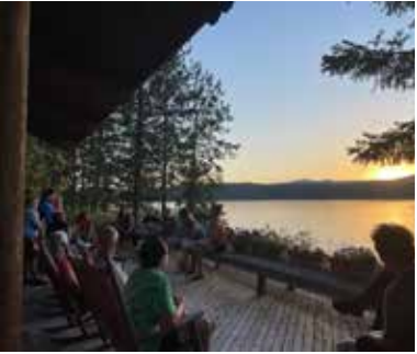
Volunteers needed this summer. Apply now.

It's not too early to start thinking about spring and summer at Camp N-Sid Sen, the Pacific Northwest Conference UCC camp and retreat center on Lake Coeur d'Alene north of Harrison, Idaho. N-Sid-Sen means "Point of Inspiration" in the the language of the indigenous Coeur d'Alene people. The well-appointed camp offers 300 acres of woodland and waterfront activities, faith-based immersion experiences, low-tech fun in God's inspiring creation and meaningful connections among fellow participants.