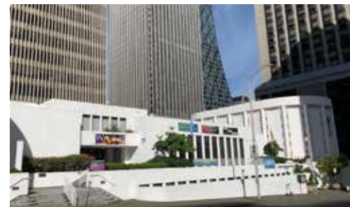
A wonderful group has stepped up to serve.

Dear Plymouth Community, On behalf of your Congregational Council I am delighted to introduce the wonderful group of Plymouth