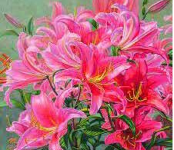
Painting by Fiona Craig.

For more information, email Office@N-Sid-Sen.org or visit N-Sid-Sen.org . ✦