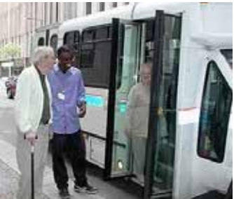
Ride the bus March 5

Horizon House residents can ride the charter bus to Plymouth the first Sunday of every month . The bus will pick you up at Horizon House and bring you to Plymouth in time for the 10:30 am service and return you to Horizon House afterward. ✦