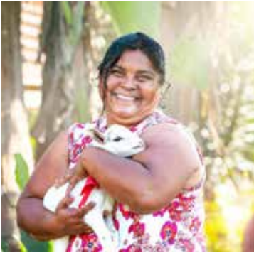
Lenten Special Offering: “Be The Light.”

Thank you for your generous and faithful support.