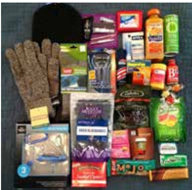
Pack bags during worship each Sunday in March.

Thank you for helping us reach out in care and compassion to the most vulnerable in our community.