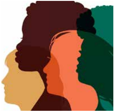
Free webinar series March 13 & 27

Link to the interview in the news article at PlymouthChurchSeattle.org .