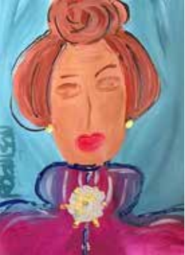
“Elizabeth Keckley,” from the Black Maids Tribute (courtesy of the artist)

“Portrait: A Tribute to Women in History” by Joey M. Robinson will be on display at Plymouth Church from March 17–May 5. This free public exhibit will consist of 12 acrylic and canvas paintings depicting abstract illustrated figures. From artists to inventors, this new series pays homage to notable women who inspired American history. An expert of color and contrast, Seattle-based artist Joey M. Robinson crafts images that are stark, primitive and powerful. Read more at JoeyMRobinson.com . 🌍