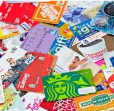
Bring unused gift cards for migrant siblings.

During the coming weeks of Lent, the Immigration Ministry Team is conducting a Gift Card Transformation Campaign . Unspent cards collected will be distributed to families in the immigration process that we are already helping. All cards will be gratefully accepted.