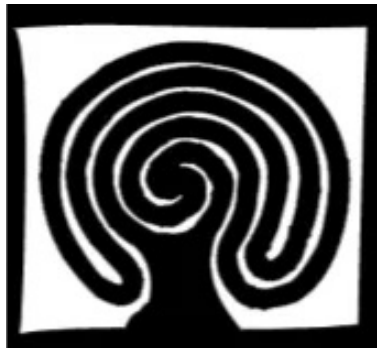
Free webinar 4:30 pm March 19.

March 19, 2024 04:30 pm PST. Link to register for this free webinar in the news article at PlymouthChurchSeattle.org . 🌍