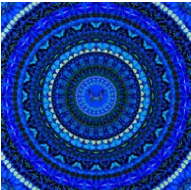
Butterfly Mandala, Damien Hirst