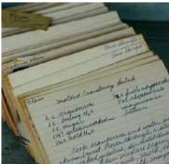
Let us know what’s cooking!