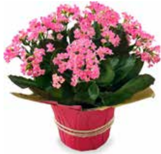
Thank you for supporting this ministry.