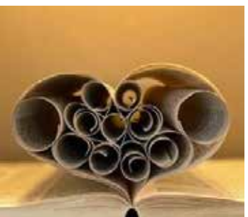
Join the celebration Sunday, April 2