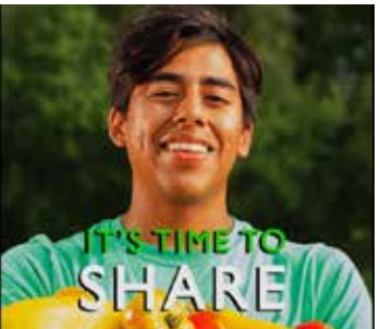
Your faithful support funds our ministries.

And to celebrate the reopening, a new reading program will be launched. Stay tuned for details. ✦