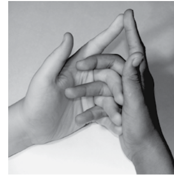
Developer Selection Committee begins work.

Hello Plymouth, and Happy Almost Spring. I'm writing again to let you know that our wonderful Developer Selection Committee (DSC) met for the first time earlier this week and thus, they are officially launched!