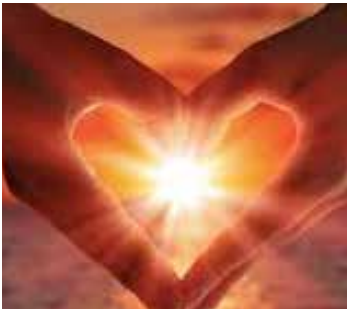
Let us know what we can do for you.

On April 15, The Downtown Emergency Service Center will officially open the STAR Center (Stability Through Access and Resources) in Seattle’s Pioneer Square neighborhood. This represents a bold new step in how we care for our neighbors experiencing chronic homelessness and serious behavioral health challenges.