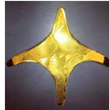
9 am-1 pm Saturday, April 12, at Plymouth.