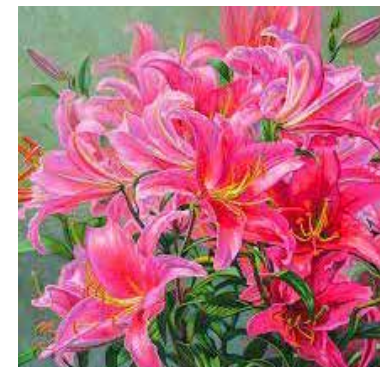
Thank you for supporting this ministry of care.