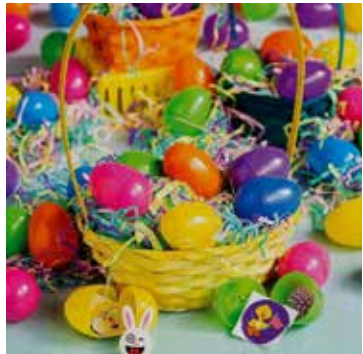
Help with Easter hospitality.