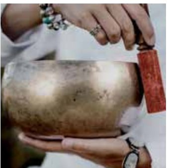
Next session Sunday, May 26.