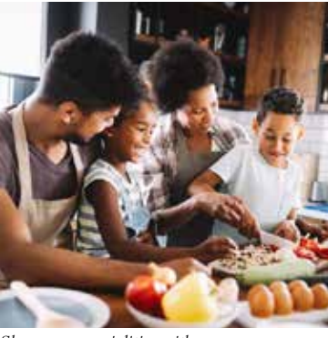
Share your specialties with us.