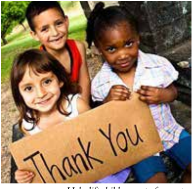
Help lift children out of poverty.

The House-passed bipartisan tax bill would expand the Child Tax Credit (CTC) for 16 million children in families with low incomes—including 5.8 million young children (under age 6)—in its first year, bringing them up to or closer to the full $2,000-per-child amount that children in higher-income families receive.