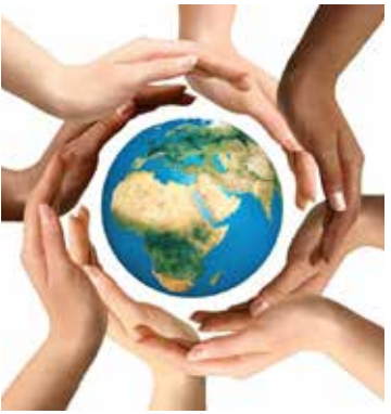
Environmental justice is social justice.

The second annual United Church of Christ Earth Day Summit took place on Saturday, April 20. The event featured celebrated author and activist Bill McKibben, who delivered the keynote lecture with the title, “Energy from Heaven or Energy from Hell?” The Rev. Brooks Berndt, minister for environmental justice for the United Church of