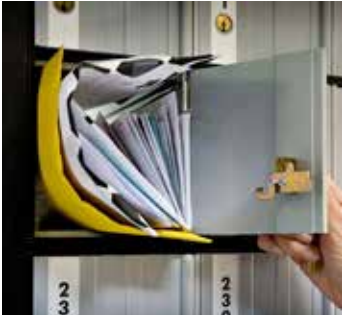
Please note our new mailing address.

Plymouth Church UCC P O Box 21368 Seattle WA 98111