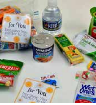
Your contributions make a world of difference.

The former sign boards outside our building are now pantries for the community, filled with food, and comfort items. The pantries provide a display of compassion and solidarity with those experiencing homelessness or who are under-resourced. Please contribute bottled water, protein bars, or even notes to remind the reader they are beloved.