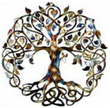
At N-Sid-Sen May 17-19.

Next session is May 26, 11:45 am in Hildebrand Hall. ( Note: start time is subject to change, determined by the length of Sunday service. ) Suggested Donation $20.