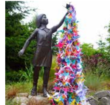
Share your prayers for peace.