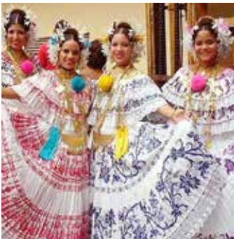
Enjoy food, fun and friendship May 11.

Questions? Contact Panama. Folklore.Seattle1@gmail.com.