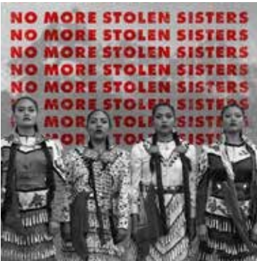
Help break the silence.

There is widespread anger and sadness in First Nations communities. Sisters, wives, mothers, daughters and two-spirits are gone from their families without clear answers. There are families whose loved ones are missing—babies growing up without mothers, mothers without daughters, and grandmothers without