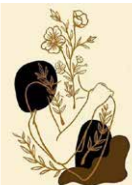
Special event at Plymouth May 18.

Let’s celebrate the maternal figures in our lives, 2–5:30 pm Saturday, May 18 at Plymouth. Who has poured into you? Who have you poured into? Let’s gather in love as we honor the legacy of our motherhood and embrace non traditional ways we mother. From the Ballroom scene to Big Mama, our guardians, aunties and queer family members, allow us to celebrate all that is MUTHA and acknowledge all it takes to be one.