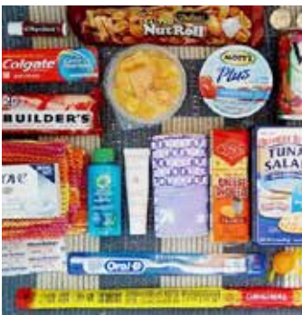
Thank you for your contributions.

The former sign boards outside our building are now pantries for the community, filled with food, and comfort items. The pantries provide a display of compassion and solidarity with those experiencing homelessness or who are under-resourced. Please contribute bottled water, protein bars, or even notes to remind the reader they are beloved.