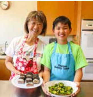
Your contributions make a world of difference.

Like to cook? Have a favorite meal to make? Be a part of the new Plymouth cookbook! Send us old family recipes, or ones you’ve created yourself. Include ingredients and instructions, and maybe a note about why the dish special to you. Send to: RTurner@PlymouthChurchSeattle.org .