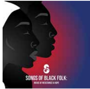
7 pm Sunday, June 16, at the Paramount.

Songs of Black Folk returns even bigger, bolder, and grander for its 2024 production 7 pm Sunday, June 16, at the iconic Paramount Theater in Seattle. Songs of Black Folk will once again present a music tradition that began on the African continent and was transported to the Americas, via slave ships, and took root in the daily